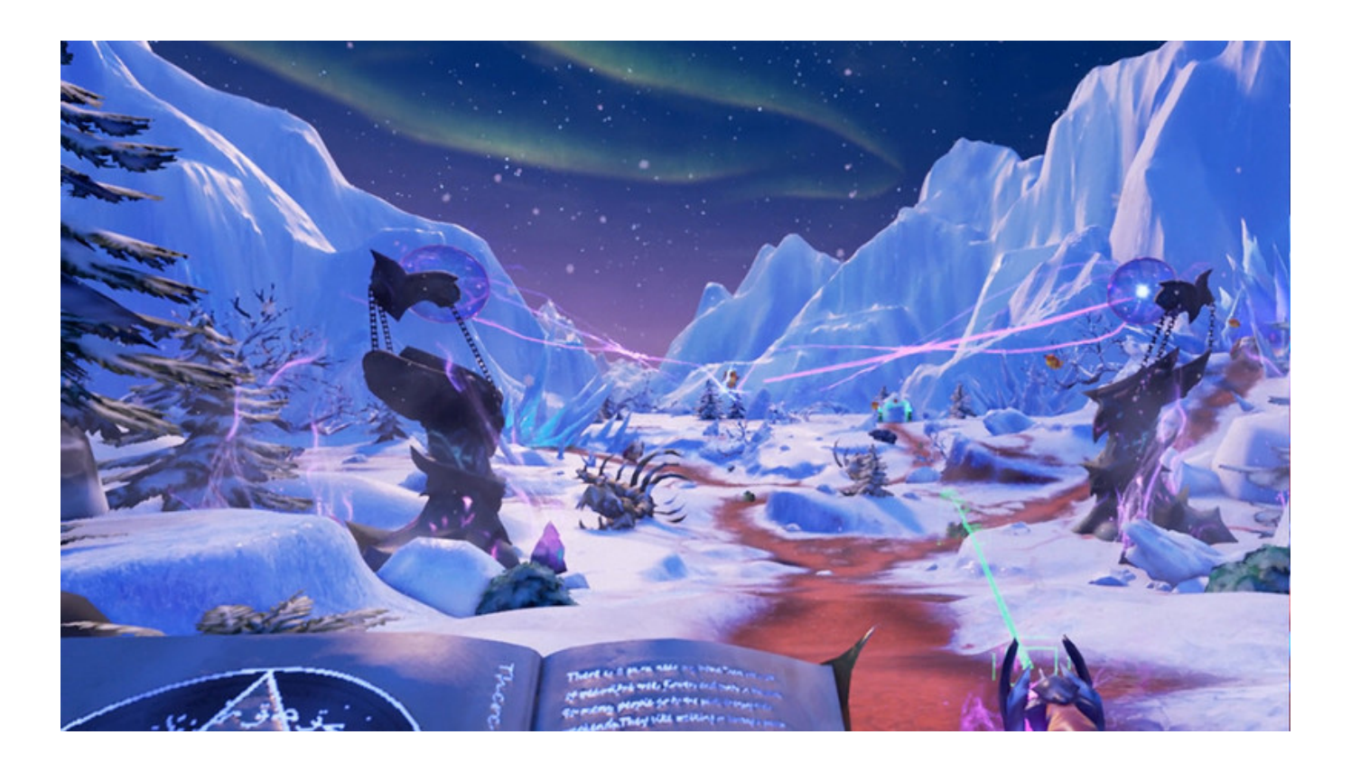
Tales Of Glacier (VR) Download Utorrent Kickass